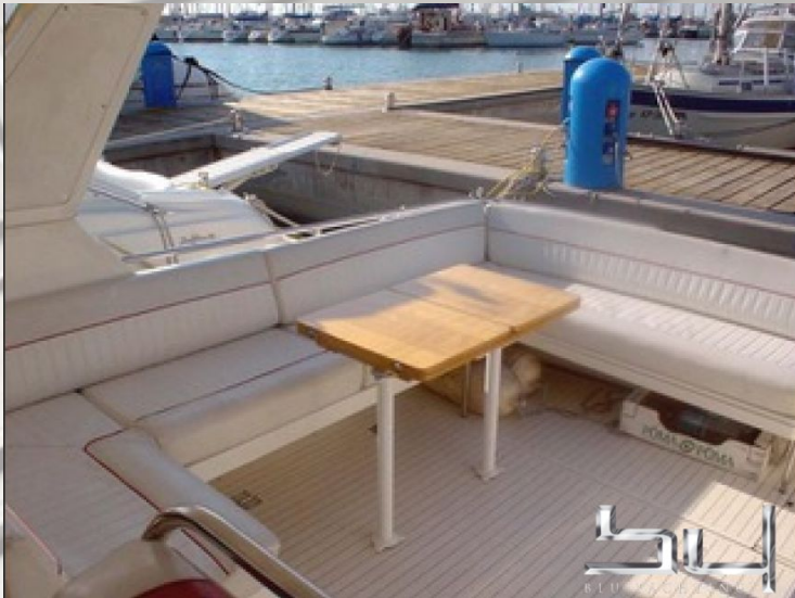
outside view - picture 9