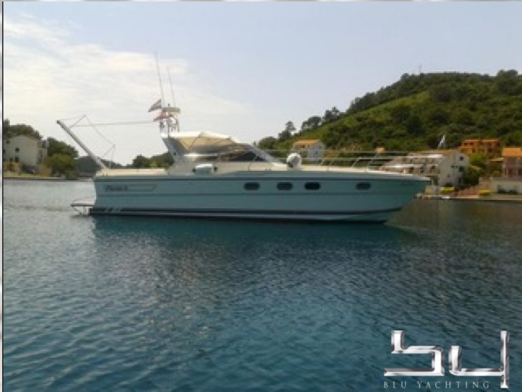
outside view - picture 1