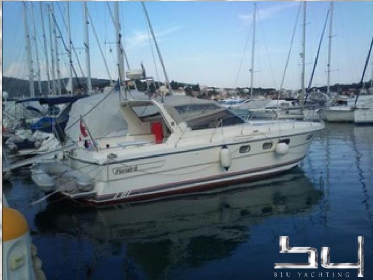
outside view - picture 7