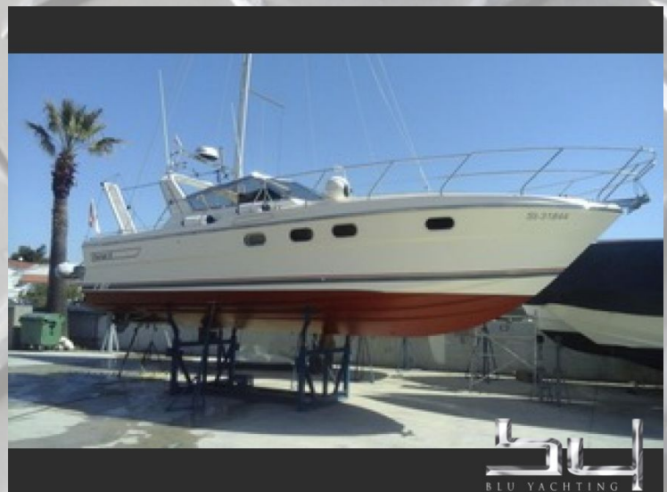
outside view - picture 6