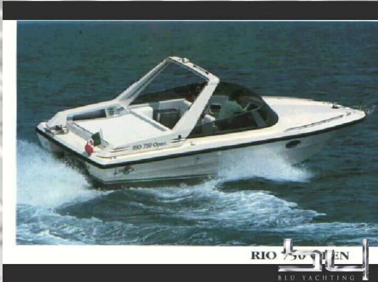
outside view - picture 1